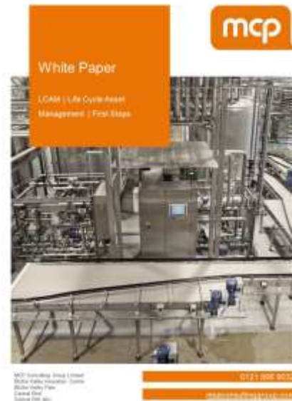
White Paper | First Steps to Life Cycle Asset Management