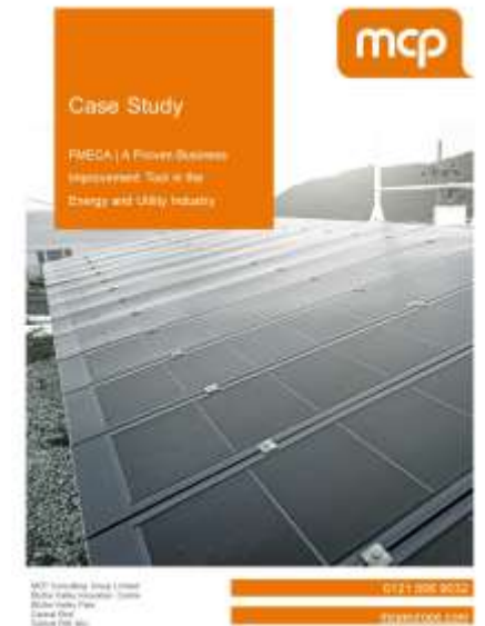
Case Study | FMECA a Business Improvement Tool