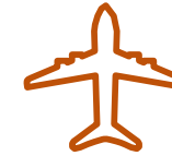
Transport & Aviation