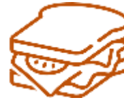
Food & Drink