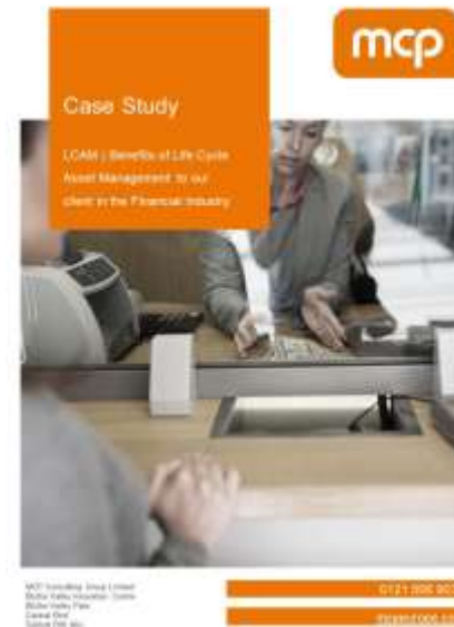
Case Study | Benefits of LCAM to Finance Industry