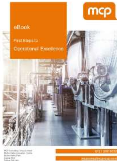
eBook | First Steps to Operational Excellence

At MCP we are always happy to share our experience, knowledge and expertise and regularly promote a variety of eBooks, white papers and case studies.